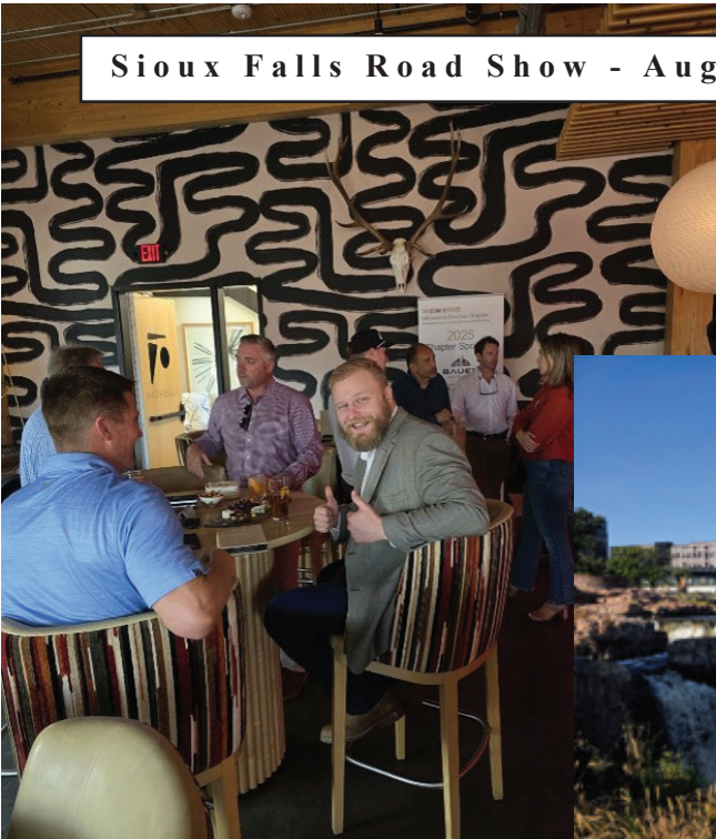
Sioux Falls Road Show - August 2025