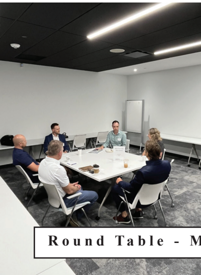
Round Table - May 2025