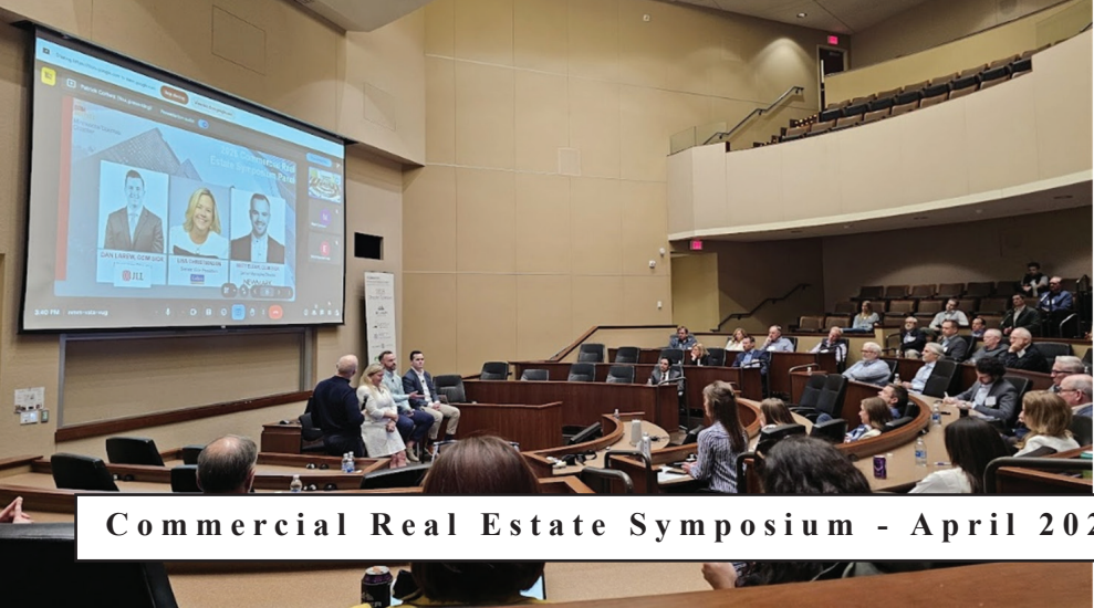
Commercial Real Estate Symposium - April 2025